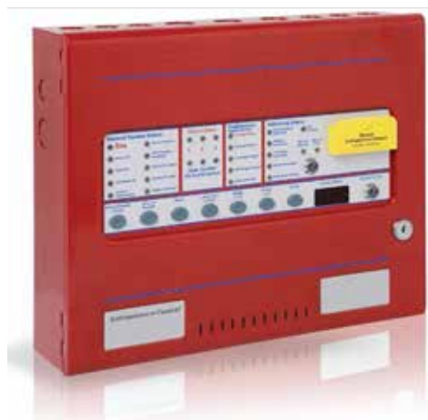
Model No. K1810-12

Approvals registered under Kentec Electronics Ltd