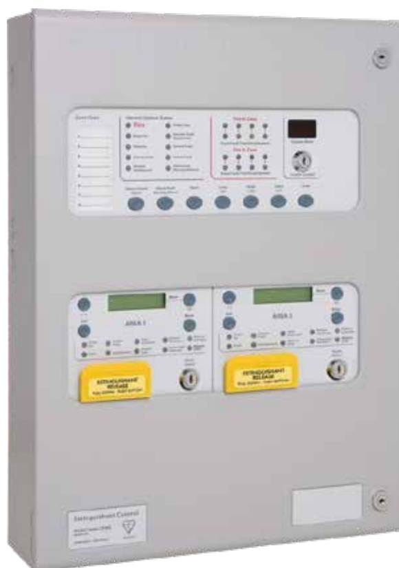
Model No. K21082M3