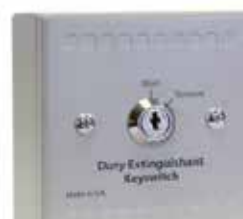
Model: K13480M10 Main/ Reserve Switch

Approvals registered under Kentec Electronics Ltd