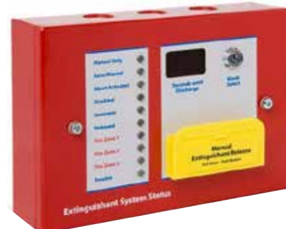
Model No. K1821-19