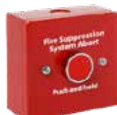
Model No. K1823-10