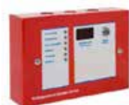
Model No. K1821-11