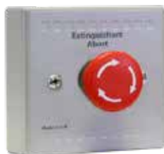
Model: K13470M10 Abort Unit