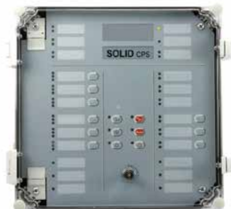
Part no.: 929022