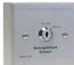
Model: K13520M10 Extract Switch