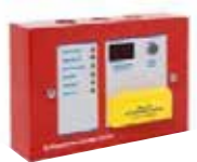
Model No. K1821-17