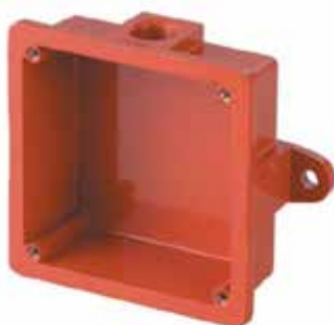
Weatherproof 4" Square Outlet Box