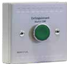
Model: K91000M10 Hold Off Unit