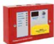
Model No. K1821-13