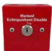
Model No. K1832-10