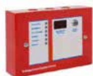
Model No. K1821-15